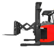
Double Deep Reach Truck